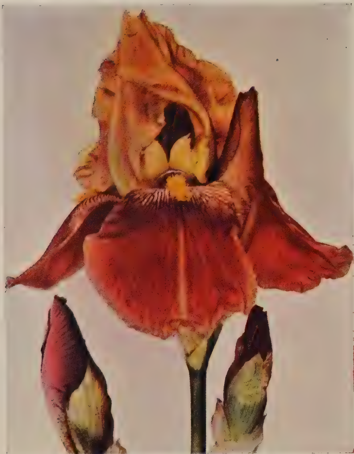
Mexico—$3.25 (Page 8)